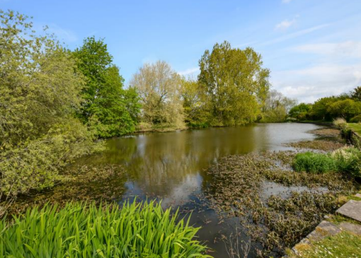
Courtyard Development in Rural Setting 5 Detached Houses