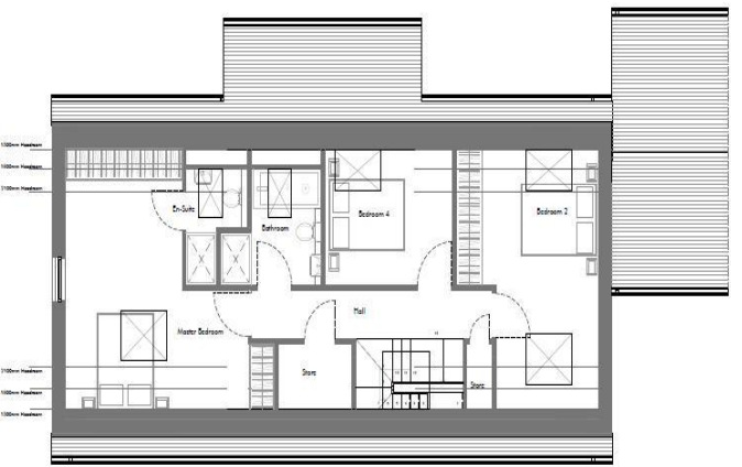
Type A - First Floor